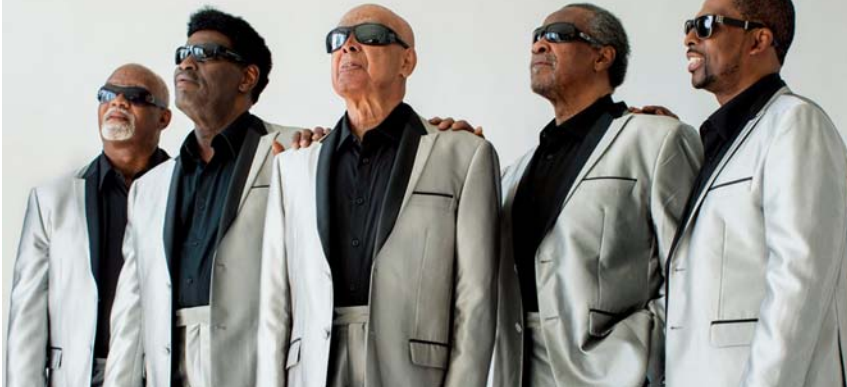
The Blind Boys of Alabama