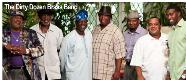
The Dirty Dozen Brass Band

*Presented in cooperation with Ted Kurland Associates