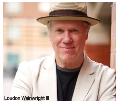
Loudon Wainwright III

*Presented in cooperation with S.A.D Booking