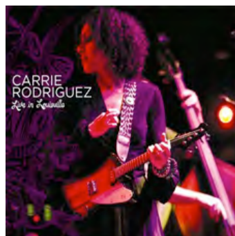
Live in Louisville 2009