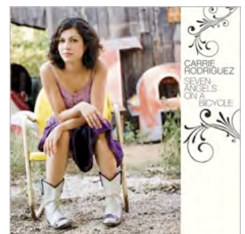
7 Angels On A Bicycle 2006