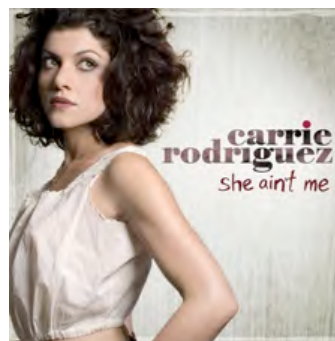
She Ain't Me 2008